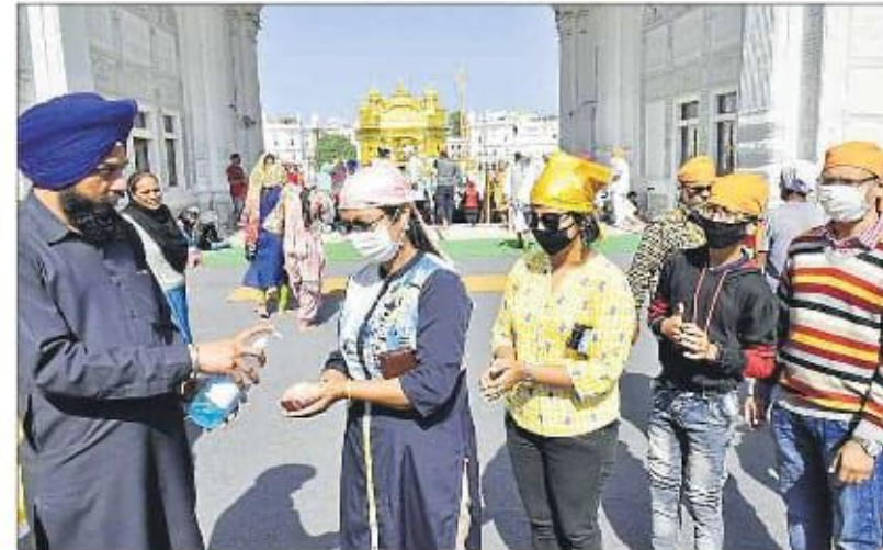
An SOPC employee helps devotees disinfect their hands with sanitiser at the entrance of the Golden Temple in Amritsar on Tuesday.